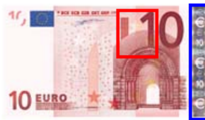
Figure 1. The detected region is surrounded in red and the plastic strip in blue

The image captured by the webcam was processed by an image analysis software called Spikenet [5]. The image analysis is mainly based on the extraction of characteristic saliencies, i.e. high contrast variations, in the pattern that has to be recognized. Spikenet is able to recognize and locate targets in images after a supervised training phase and is highly robust to scale, contrast, brightness and noise variations [6]. We built all the object models to recognize the 5€, 10€, 20€ and 50€ bills from just one image sample per bill. To preserve the selectiveness of the classification, we have chosen each sample in a particular region of each bill, which contained characteristic saliencies that differ enough from one bill to the others. Each sample was rotated by steps of 12° to cover all the orientations. This finally results in 120 training samples for the four bills ((360°/12°) x 4 bills). Following this training phase, the device was able to detect a particular region of each bill (close to the plastic strip, Figure 1), within a range of three to ten centimeters, regardless of the bill orientation and at a rate of five images per second. The false positive rate could be evaluated below 10 -8 , as no false positive classification had been observed in the context of this experiment.