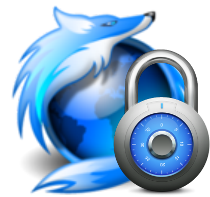
Secured Internet (https)