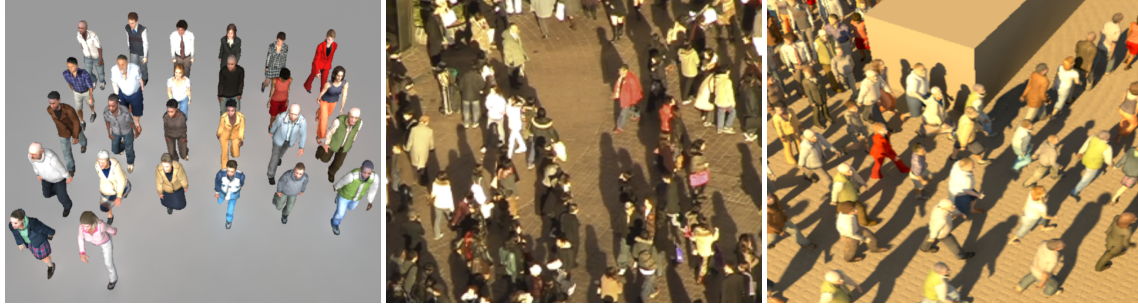
Figure 2. Crowd Rendering. From left to right: the 26 different avatars used to produce the videos (their choice has been made to exhibit the maximum variability w.r.t. age, sex and cloths style); a real image from a video footage of Shibuya in Tokyo; a crowd rendering with similar day light conditions